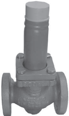
VFGS DN 15 - 125