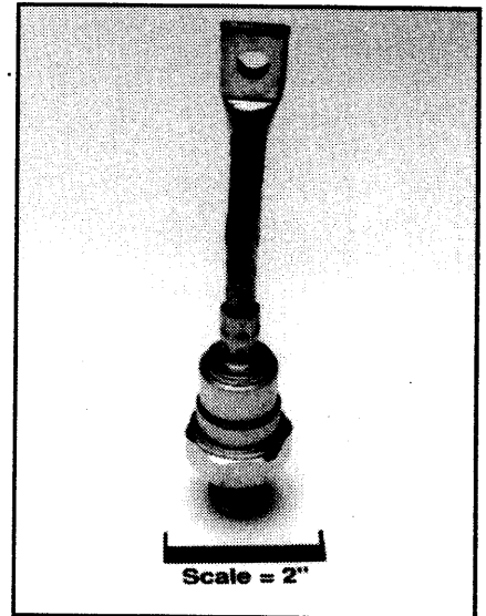
R602__22/R603__22 Fast Recovery Rectifier 220 Amperes Average, 1600 Volts