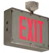
Severe™ XVHZ & XVEHZ Exit series PG. 52-53