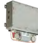
Severe™ VH Battery unit PG. 112-113