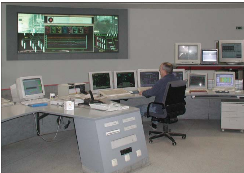
The central control room at Deuna.

During the primary commissioning periods, the strategies were tuned for the conditions prevailing at the time. However, not all possible conditions