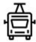
ABB attaches particular importance to reliability, availability and safety of its products and solutions. Special emphasis is given to minimize installation and maintenance efforts.

Traction power networks require highest uptime, robust and reliable products guaranteeing seamless operation. ABB offers a comprehensive product and solution portfolio covering all functional requirements.