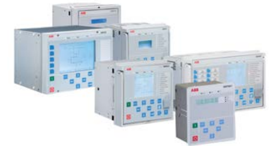
ABB offers a complete range of smart energy management systems in different technologies and for all applications.

Recycling the braking energy is the single largest opportunity to improve energy efficiency.