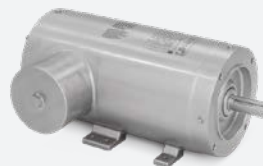
Three phase inverter duty