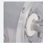
Endplate and seal

When an application requires cleaning solutions and light washdowns that could potentially compromise the surface of a painted motor, paint free motors are the answer.