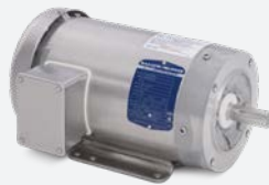
Three phase inverter duty