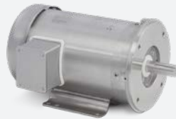
Three phase inverter duty