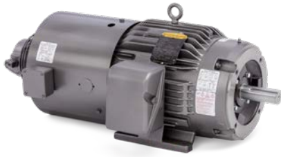
Inverter Duty Blower Cooled