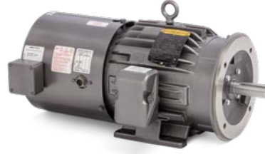
Vector Duty Blower Cooled