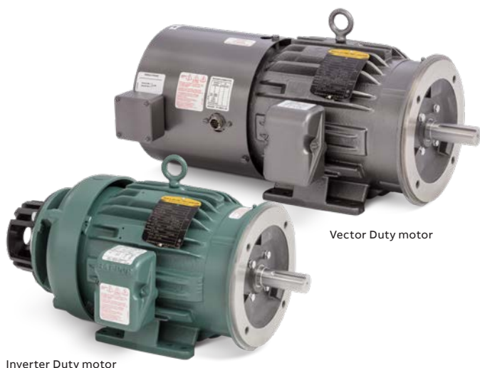
Inverter Duty motor