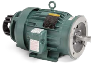
Inverter Duty with encoder provisions