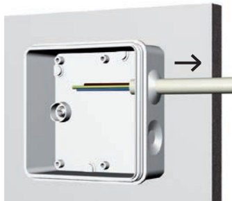
03 Pull the cable back to seal the input, box seal = IP55.