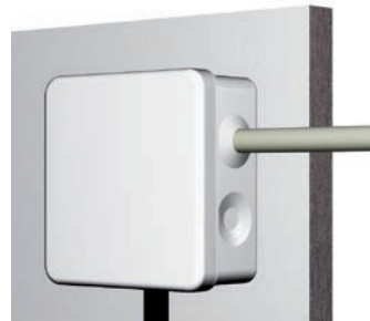
04 The box is closed by clipping the cover on, no screws are necessary.