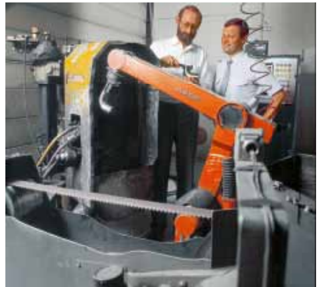
In 1974, Magnusson AB became Asea's first external robotics customer. The company used the robot to polish stainless steel pipes for use in the food industry.