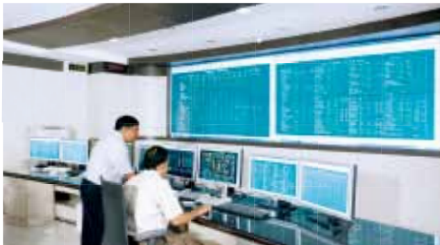
KPTCL's control room in Bangalore, delivered by ABB between 2007 and 2009. The system enables the monitoring and control of the entire power distribution network for the state of Karnataka, serving some 16 million people.