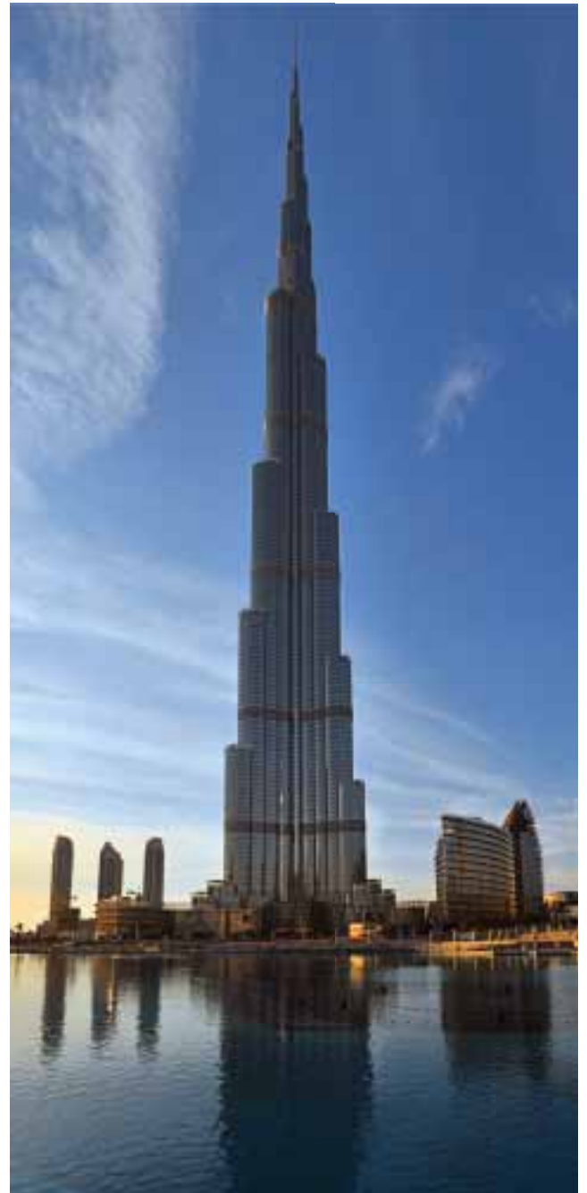
The Burj Khalifa in Dubai, the world's tallest building, is equipped with ABB transformers.

When completed in January 2010, Burj Khalifa in Dubai became the world's tallest building, with 164 floors and a total height of 828 meters. To ensure power reliability throughout the building, it is equipped with 78 ABB dry-type transformers, which are renowned for their mechanical strength and reliability. The nearby Dubai Fountain, which is illuminated by 6,600 lights and shoots water