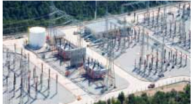
A 440 kV air-insulated switchgear installed by ABB near São Paulo in Brazil, 2007.