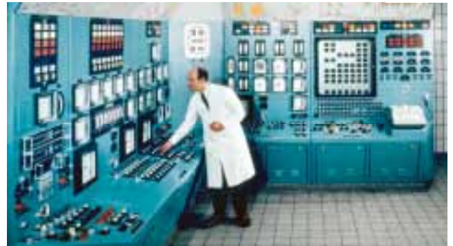
A typical control room from the late 1960s. This control system was produced by Taylor Automation, which became part of the ABB Group in 1990.

System 800xA can not only integrate the automation and information management systems in a single plant, but