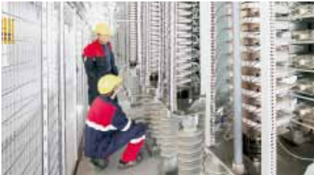
FACTS installation to support increasing electricity demand in Norway, 2009. FACTS technologies can enhance the security, capacity and flexibility of transmission systems.