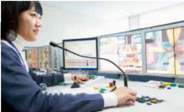
A remote crane operator in the central control room at Busan Newport, South Korea, in 2009. 42 cranes are controlled from this room.