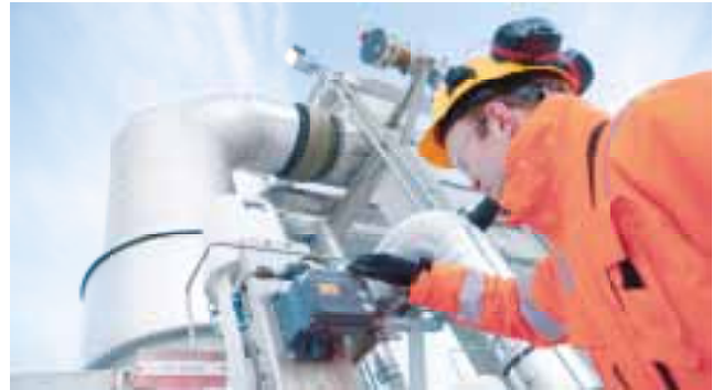
The giant Ormen Lange gas processing plant in Norway is equipped with ABB's System 800xA. The plant supplies 20 percent of the UK's gas supplies via the world's longest underwater pipeline.

The refinery is linked to the Paragominas bauxite mine by a 244-kilometer pipeline – the first of its kind in the world - through which up to 14.4 million tons of bauxite a year is delivered for processing into alumina.