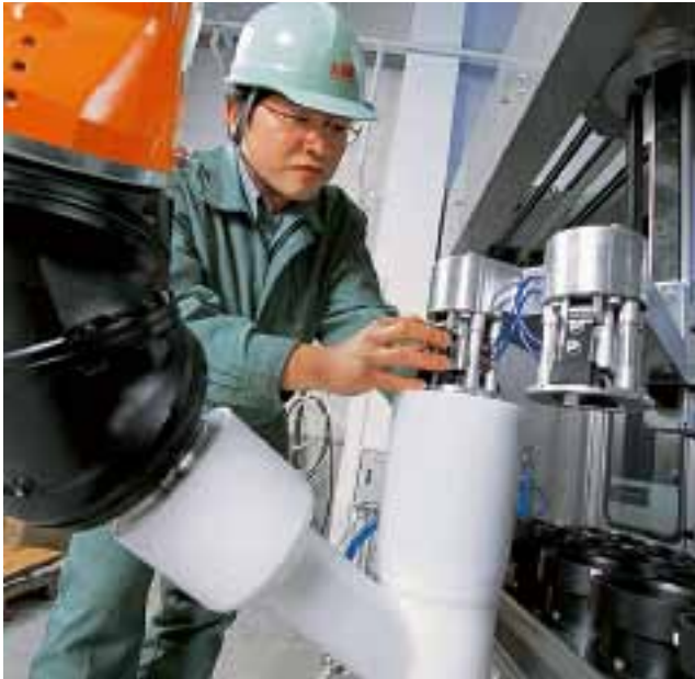
ABB's FlexPainter IRB 5500 in 2009, combining fast painting speed with resource efficiency.