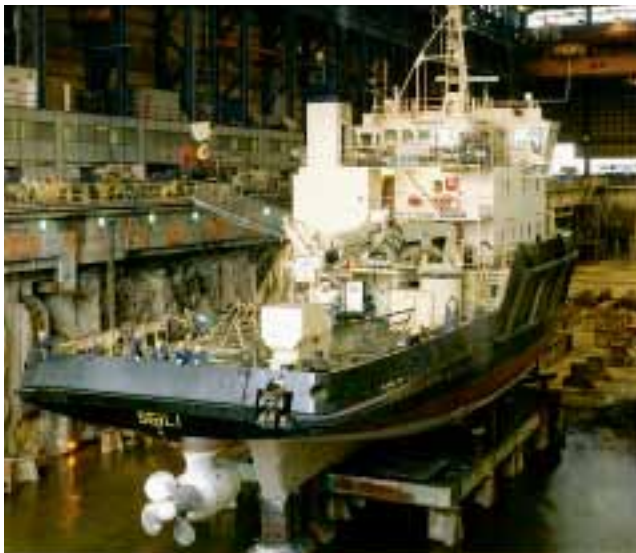
Waterway service vessel Seili was fitted with the first Azipod prototype in 1990. Azipod propulsion has now been installed in 81 vessels and has accumulated more than 5 million hours of operation.