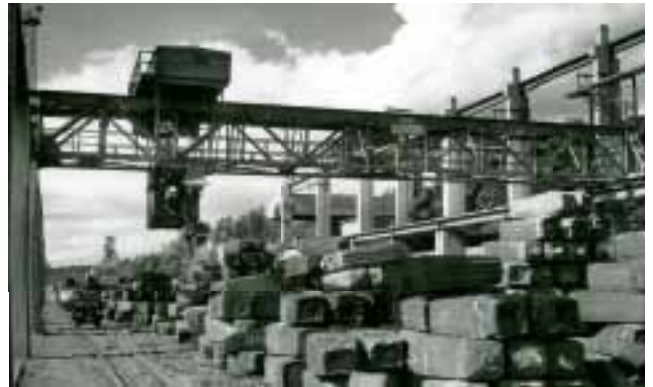
An Asea magnetic gantry crane at Fagersta Bruks AB, Sweden. The crane has a 30m span and lifting capacity of up to 12 tons (1950s).