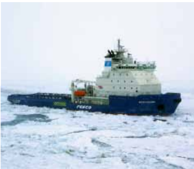
Icebreaking support vessel Fesco Sakhalin uses two 6.5 MW Azipod units, delivered 2006. ABB is the world's leading supplier of power and propulsion systems for the marine industry.

ships to operate in more confined spaces and in more challenging sea conditions, and the near elimination of noise and vibrations is a comfort to passengers, especially on luxury cruise liners.