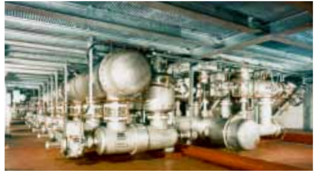
One of the world's first gas-insulated switchgear installations in Sempersteig, Switzerland, delivered in 1966 and commissioned in 1967.

ABB's substation technologies will continue to play a central role in the evolution of the world's power networks, supporting the development of more reliable, flexible and smarter grids.