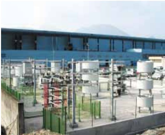
A FACTS installation at a steel mill in Italy, 2002. By improving the power quality in such plants, FACTS technology can raise productivity by several percentage points.

vides grid stability and a means of storing energy while prices are low, for use during periods of higher demand.