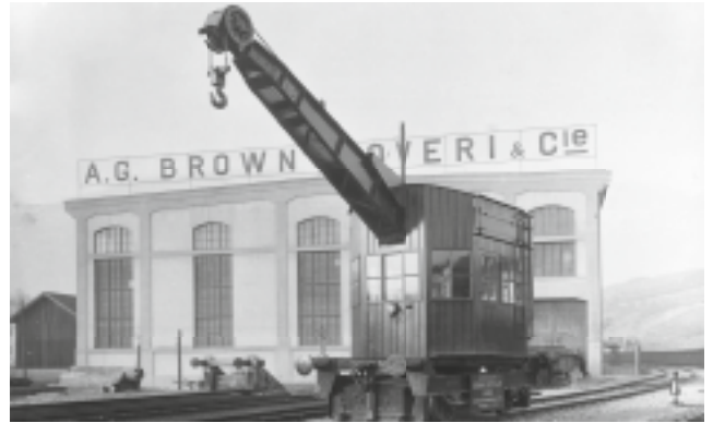
An electric crane (non-production model) built by BBC in the early 1900s.

Evergreen Marine terminal, Kaohsiung: 6 ARMGs (2005); Taipei Port Container Terminal, Taipei, 40 ARMGs (2006 and 2008); Yang Ming Lines, Kaoming, 22 ARMGs (2009).