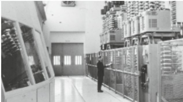
A technician in the Gotland valve hall, part of the world's first commercial HVDC transmission system, commissioned in 1954.