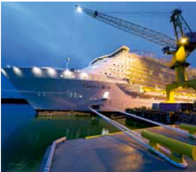
Oasis of the Seas, launched in 2009, is currently the largest cruise ship ever built and the first to be equipped with three fully steerable Azipod units. The Azipod system's low noise advantages are particularly important on luxury cruise liners.