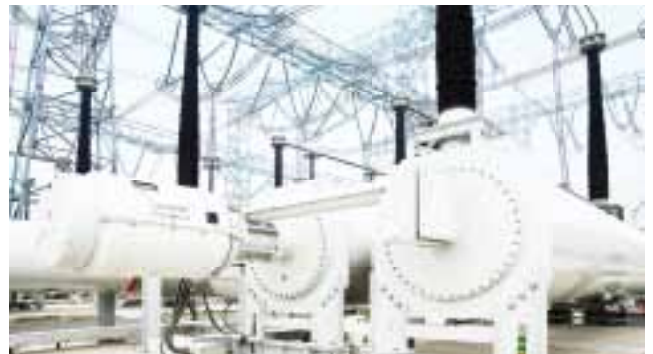
ABB commissioned ultrahigh-voltage gas-insulated switchgear at a record-breaking 1,100 kV in 2009, further raising the efficiency of long-distance transmission.