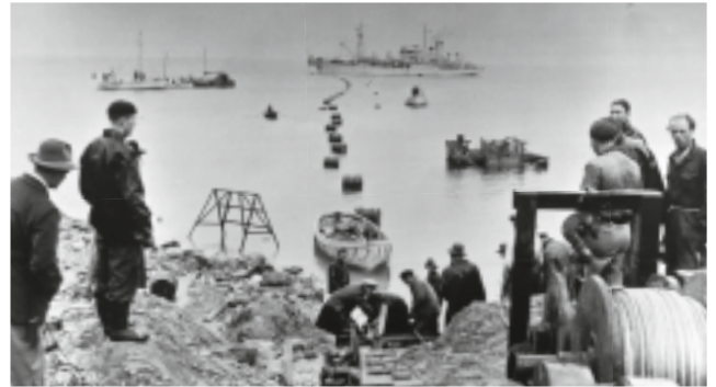
Pulling the Gotland cable ashore in 1950. The power link connected the island to Sweden's mainland power grid, supporting the development of the island's economy.

Some of the world's biggest cities, including Los Angeles, São Paulo, Shanghai, and Delhi, rely on HVDC transmissions to deliver huge amounts of electricity, often from