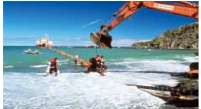
Laying cables for the New Zealand interisland link across the Cook Strait, 1985. The link delivers hydropower from the South Island to centers of demand in the north.