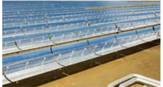
System 800xA is used to control parabolic mirrors in Europe's largest thermal solar power plant, Andasol, in southern Spain. Tracking the sun's movement across the sky ensures maximum productivity.