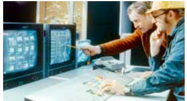
The Tesselator color display system, launched in 1983, gave operators a clear view of automated processes.