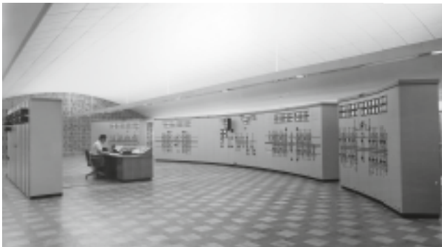
The City of Malmö Gas and Electricity control room (now part of E.ON), around 1950. The design of control rooms changed little between the 1920s and early 1970s, when computers were introduced and large wall panels were replaced by computer screens.