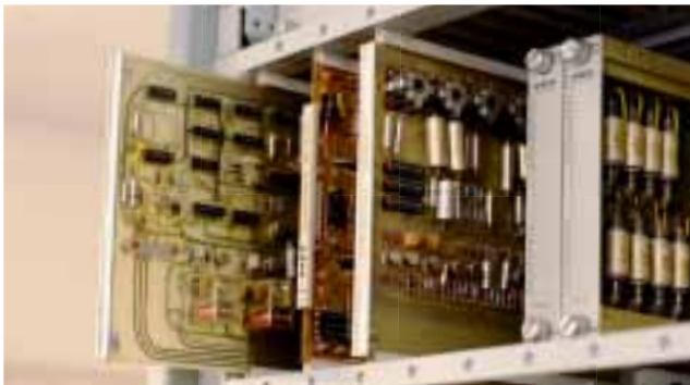
A close-up of the first computerized network management system used to monitor and control operations, delivered to Stora Kopparberg Bergslag AB, Sweden, in 1969. The system was replaced by a newer version of the same technology in 1989.

ABB has supplied many of the world's energy trading systems – in California, China, Singapore, Australia, the Philippines, to name a few. The systems provide traders with information on pricing and demand, and automated buying and selling facilities. The New York system is one of the world's largest, enabling its operator to manage a highly complex and congested power network. Electricity worth about $12 billion is traded annually using ABB's system, which is recognized as the international benchmark for the industry.