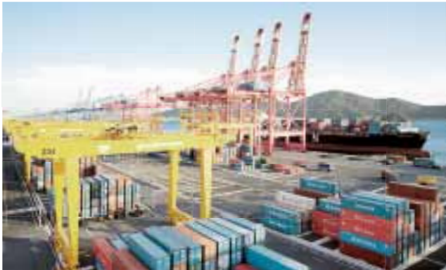
Dual-hoist, ship-to-shore cranes and automated rail-mounted gantry cranes at Busan Newport in South Korea, installed by ABB in 2009.