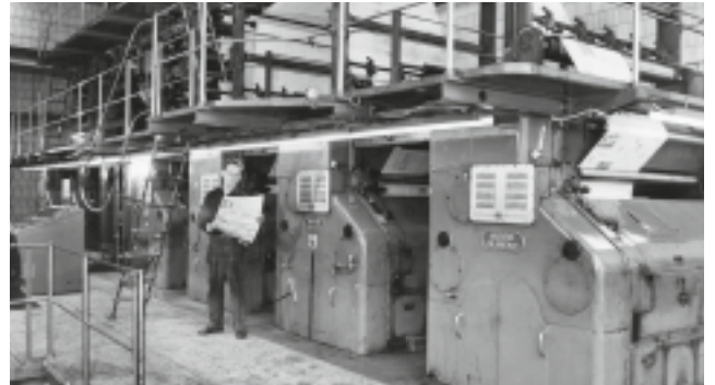
In the mid-1960s, prior to the introduction of modern variable speed drives, ABB's forerunner delivered drive and control systems for the printing presses at Sweden's largest newspapers, including Svenska Dagbladet, shown here.

As society faces the challenge of reducing environmental impact while meeting rising demand for electricity, ABB's drives will be making a positive contribution for many years to come.