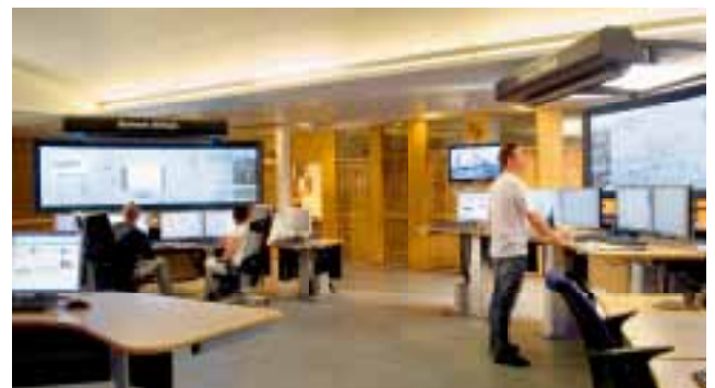
Since 2005, ABB has revolutionized operator effectiveness and control room design with System 800xA and the Extended Operator Workplace, as used at the Tjeldbergodden gas terminal in Norway.