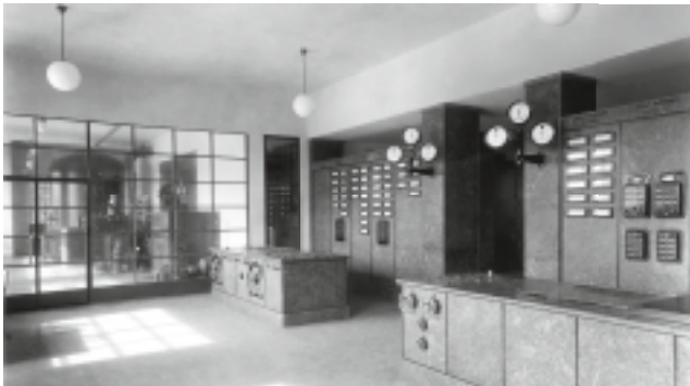
In 1933, the electricity supply for the Swedish capital, Stockholm, was overseen from this room, equipped with Asea monitoring and control systems. The network served about half a million people.