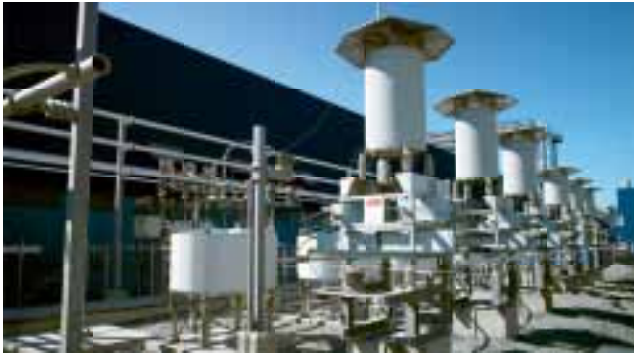
A FACTS installation in Finland, 2005, stabilizing voltage and current fluctuations in Finland, 2006. The technology helps to counteract interference with local power networks that cause problems such as lighting flicker.