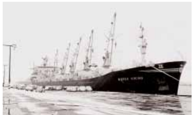
The "Viking Norse" was equipped with six 8-ton, electro-hydraulic, programmable deck cranes (late 1970s).