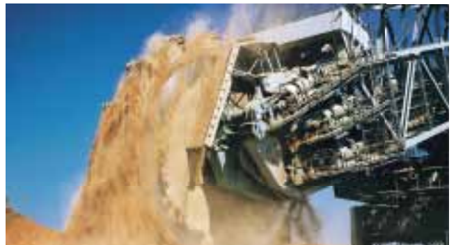
ABB drive systems combine outstanding efficiency with compact design, important qualities in large machinery like this excavator.