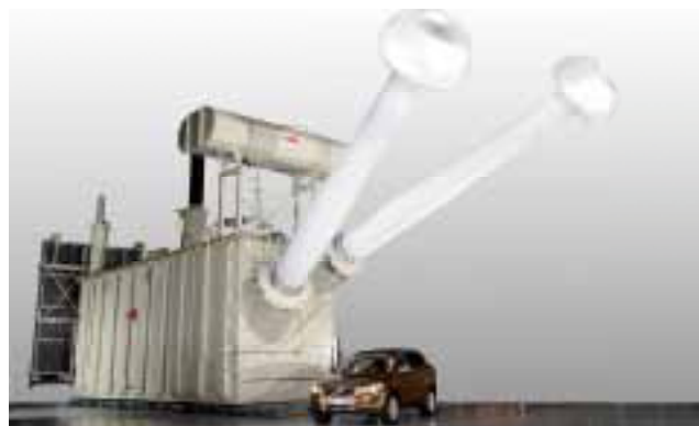
The world's first 800 kV UHVDC power transformer, delivered by ABB for the Xiangjiaba-Shanghai transmission link in China, 2008.