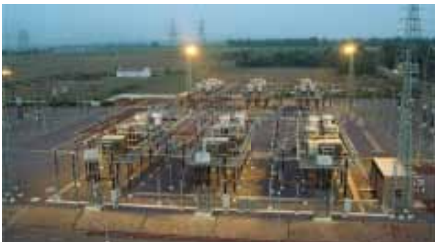
FACTS installations at Raipur in India, enabling power to be transferred from India's eastern power grid to the west and south of the country.