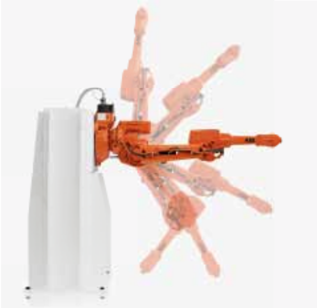
The IRB 2600, launched in 2010, has a payload capacity of up to 20 kg and an ultrawide working range. It has the smallest footprint in its class.

for companies like AstraZeneca, GlaxoSmithKline, Johnson & Johnson and Schering-Plough. They are even being used in hospitals to help with physiotherapy sessions.