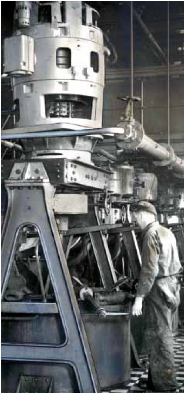
Fully automatic power system for operating sugar centrifuges in 1943