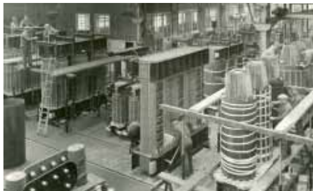
Asea's transformer factory in Ludvika, Sweden, 1923. Operations began in Ludvika in 1900 under the name Elektriska AB Magnet, which became Asea in 1916.

Besides setting new records in transformer power ratings for both AC and DC transmission, ABB has developed several innovations, including the world's first 800 kV DC bushings (for a high-voltage DC transmission system in China); the world's most efficient subsea transformer, one that can serve offshore oil and gas fields from the sea bed at depths of up to 3,000 meters;