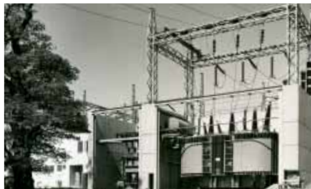
In 1942, Asea delivered what was then the world's largest transformer (120 MVA, 220 kV) to the Värtan substation in Stockholm.