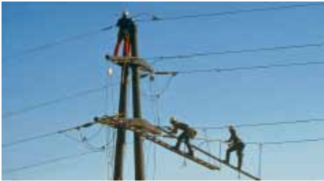
Engineers integrate fiber-optic cables into existing transmission lines for Swiss utility EKZ in 2006. ABB's communication equipment is used world wide to transmit voice, data, and protection signals on high-voltage lines.

Karnataka is India's fastest growing state and its capital, Bangalore, is an international hub for the global IT and biotechnology industries. In 2009 ABB delivered a solution that integrates the state's power transmission and distribution systems, energy audit and customer billing systems into a single state-of-the-art platform. The solution monitors the power network of the entire state, provides accurate and real-time information on power supply and revenues, and enables operators to identify and correct faults quickly.