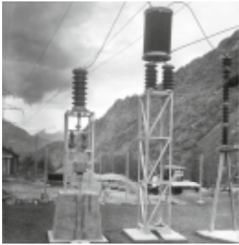
One of ABB's first utility communications installations, circa 1944. The equipment enabled grid operators to transmit signals along their own power lines.