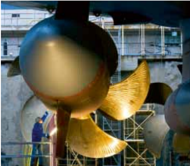
An Azipod unit in dry dock, 2009. The pod contains the high-efficiency electric motor that drives the propeller, saving space on board for additional cargo and greater design flexibility.