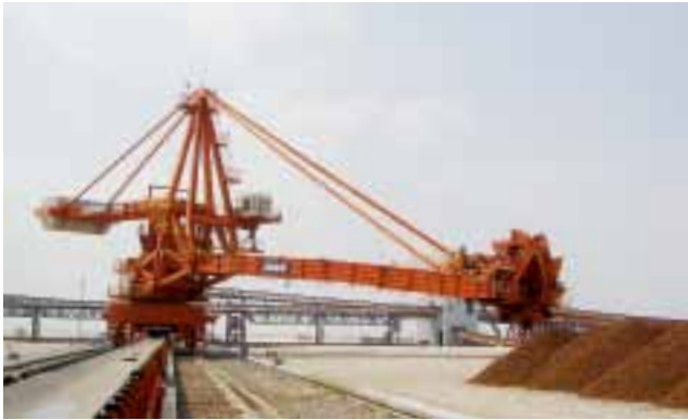
Automated cranes were installed by ABB in 2009, modernizing Shanghai's Luojing port, China's largest bulk-cargo terminal. ABB's electric crane systems are three to four times more energy efficient than diesel cranes and produce no local greenhouse gas emissions.