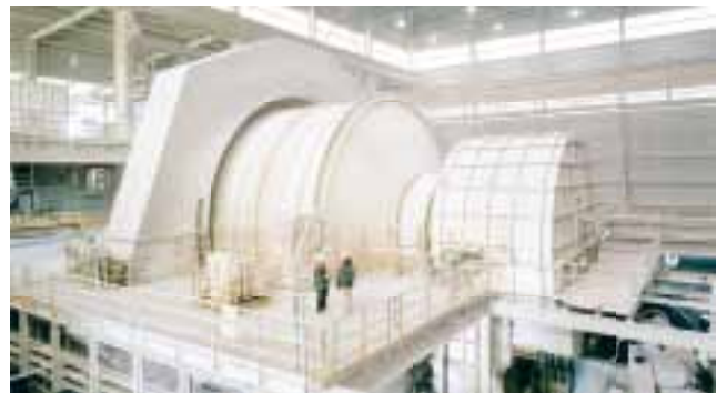
The Collahuasi copper mine in northern Chile uses a range of ABB power and automation products, including the world's largest gearless mill drive (shown here) and System 800xA to optimize operations.