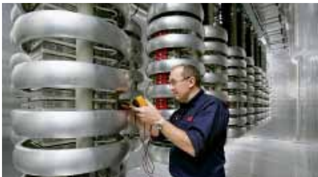
An ABB technician tests HVDC Light valves, used to connect the world's most remote wind farm, 125 km off the German coast, in 2009.

thousands of kilometers away, with remarkable efficiency and minimal environmental impact.