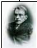
ABB technology: selected highlights since 1883

1889 Jonas Wenström invents the three-phase system for generators, motors and transformers.