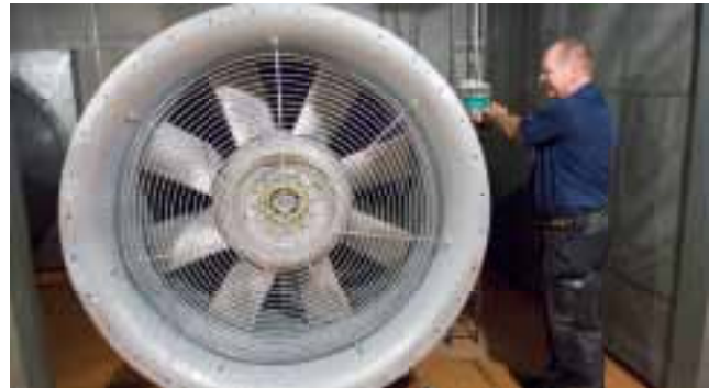
A new fan system powered and controlled by ABB motors and drives reduced energy bills at a Swedish hospital by $400,000 in 2005.