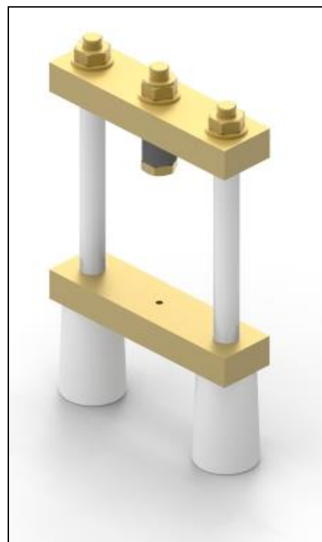
Figure 1: Clamp General Assembly